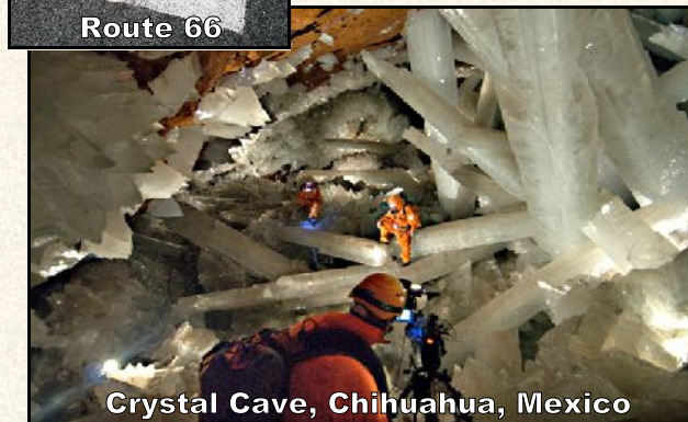
Crystal Cave, Chihuahua, Mexico