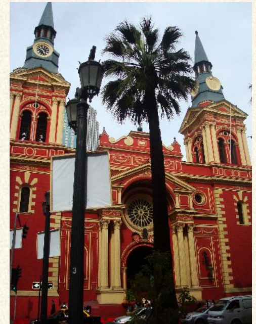
Central and South America

General Information: (845) 224-3153 Membership: (845) 462-7308